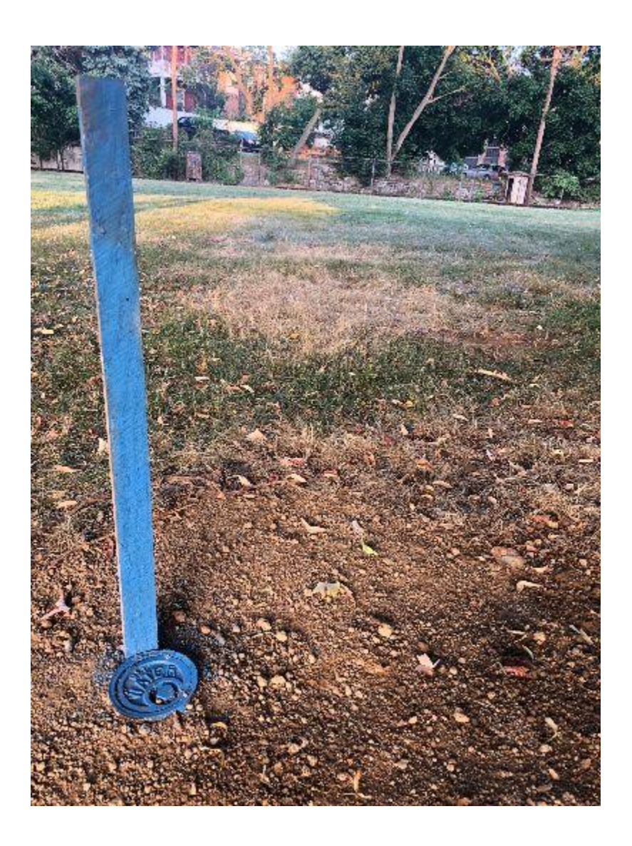
Next, E.K. Services installed the water line extension.

First, York Water Company extended the water access and installed the meter pit. This will eventually serve our water fountains to keep pals hydrated while playing.